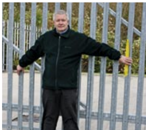
Measuring the angle of vision was easy using these perfectly placed fence posts