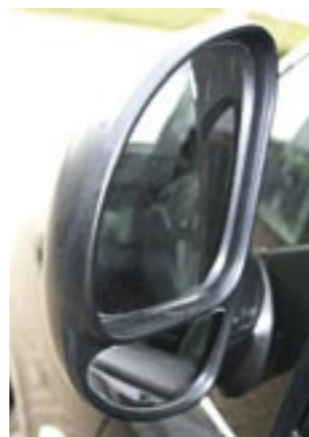
The Fiat Multipla mirror is one of the most complex on the market