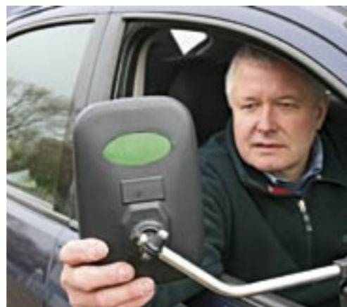
Some towing mirrors could be adjusted from the driving seat, but some needed tools and muscles!