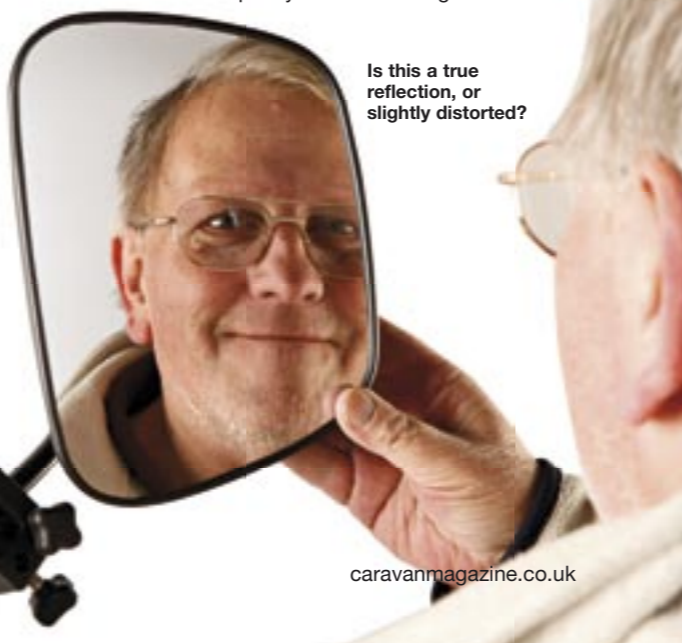
Is this a true reflection, or slightly distorted?

The EU and UN standards for towing mirrors specify a minimum angle of view.